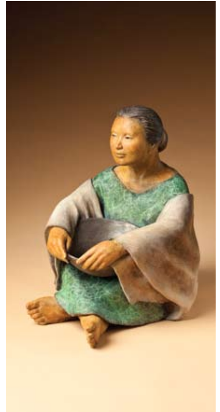
Liz Wolf, Dreamtime , bronze, 15 x 11½ x 16"