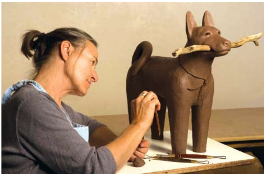
Liz Wolf, The Gift , clay for bronze in progress, 19 x 20 x 15"