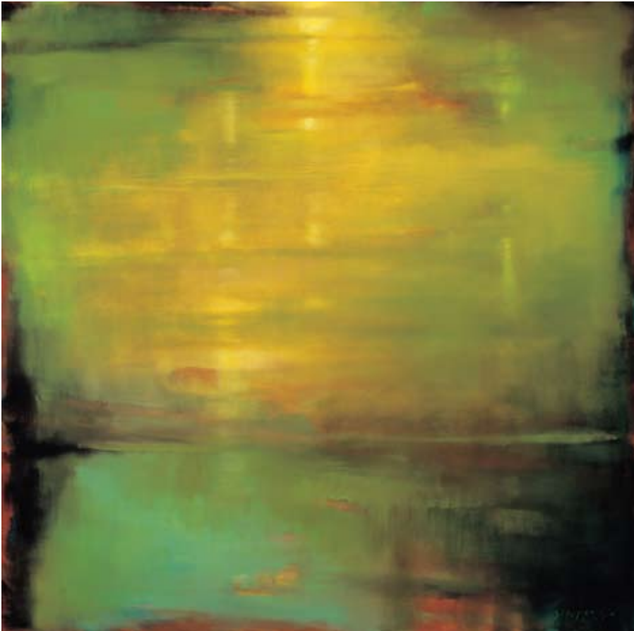
Robert Striffolino, Waterscape #13 , oil, 60 x 60"

Waterscape series came about because he wanted subject matter in nature that eliminated traditional foreground, middle ground and background.