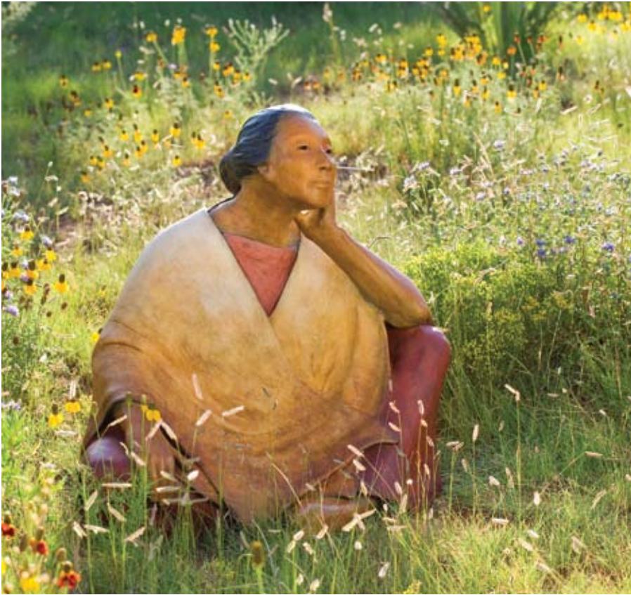
Liz Wolf, Listening , bronze, 24 x 24 x 19"